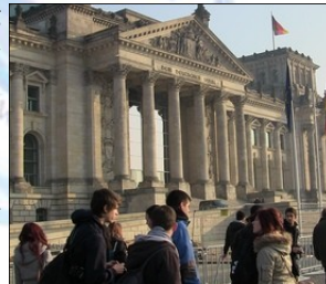
Excursion to Berlin

stationed during the war. We saw the most significant buildings in the capital of Germany: Reichstag and the Brandenburg Gate.