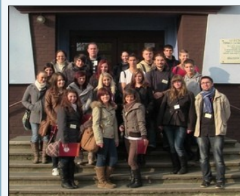
Visiting school area

jającym się świecie. Kontakt z młodzieżą węgierską oraz wspólna praca znacząco wzbogaca i usprawnia nasze umiejętności językowe i komunikacyjne. Wszystko to okaże się wartościowe w najbliższej przyszłości.