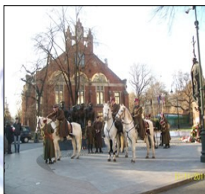
Celebration of Independence

great opportunity for us to expand our knowledge of Cracow's history.