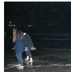
The Baltic Sea

On Wednesday we were divided into groups and we were making the summary of our project in different ways, for example preparing leaflets, a newsletter and a glass-case exhibition.