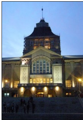
Trip to Szczecin

On the next day we took a trip to Berlin. We went sightseeing the city and then we visited the place near the Berlin Wall crossing, known as Checkpoint Charlie, where the American troops