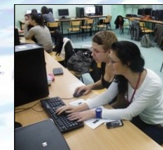
Students at work

On Tuesday we went to Świnoujście. During the journey we went to the crooked forest situated in the village Nowe Czarnowo. While in Świnoujście we climbed the lighthouse, which is